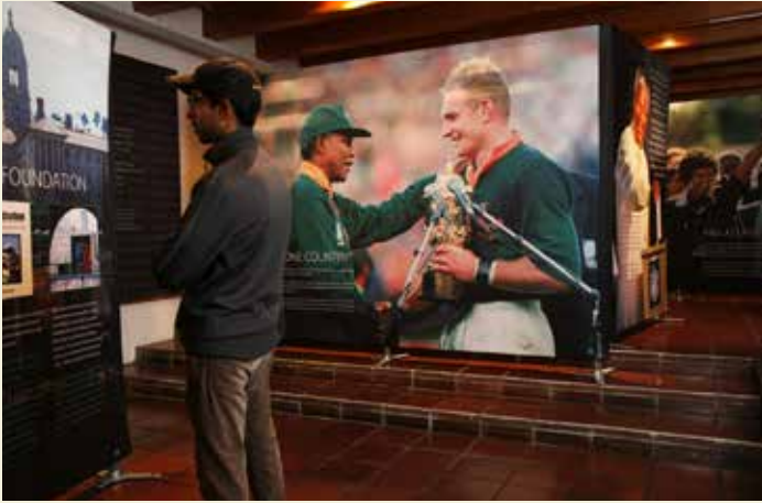
A visitor engages with the Mandela exhibition, which was on display at the Iziko Slave Lodge.