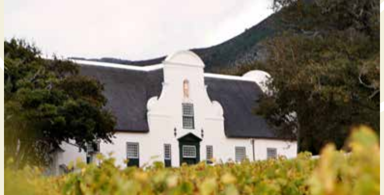
The historic Manor House at Groot Constantia.