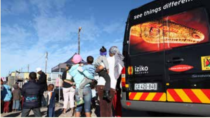
On outreach with the Iziko Mobile Museum, which takes our museums to communities unable to visit our museums.