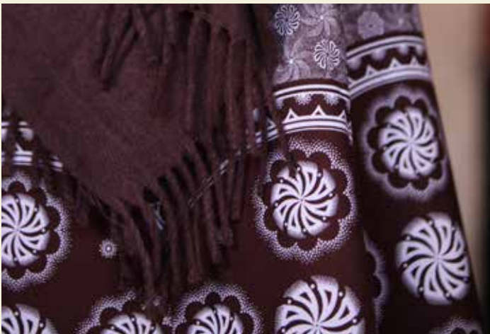
isishweshwe fabric, part of the exhibition entitled, The isishweshwe story: material women? at the Iziko Slave Lodge.