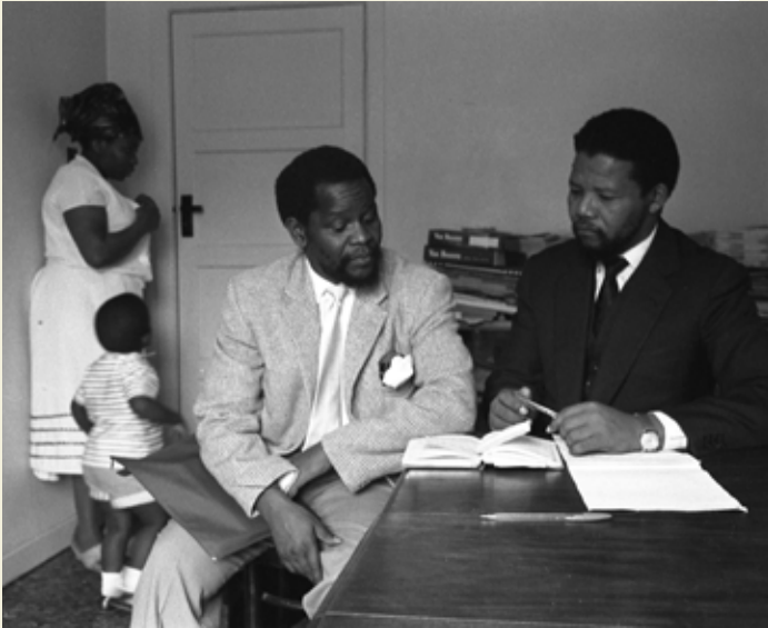
Nelson Mandela visiting Adelaide and Oliver Tambo in their home in London in 1962 – to explain to Tambo the decision to adopt the armed struggle. Oliver Reginald Tambo: The modest revolutionary is a tribute to the late ANC leader and political stalwart. On display at the Iziko Slave Lodge.