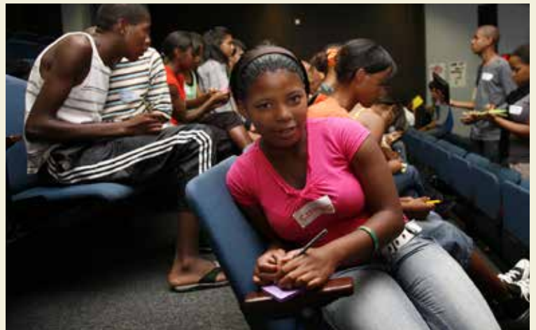
Opening inter-generational dialogue. Engaging with youth at the Iziko Summer School.