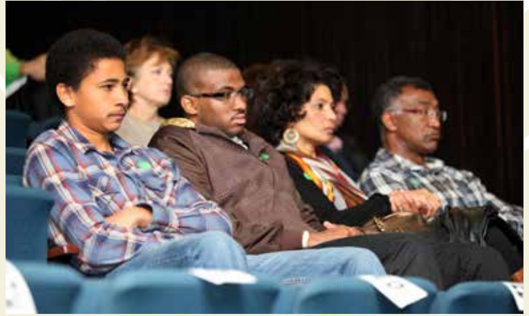
The Iziko Summer School programme creates a space for dialogue, debate, learning and the appreciation of our rich South African heritage - among young and old.