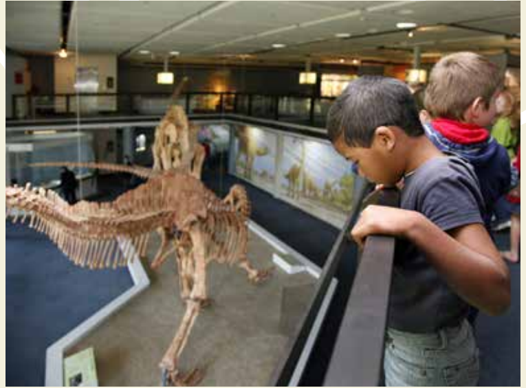
Young museum visitors take a step back into the time when dinosaurs roamed the Earth with the African Dinosaurs exhibition, on display at the Iziko South African Museum.